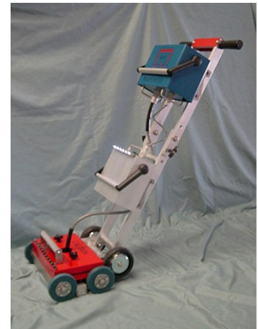
2412 Mark II

MFE Tank Bottom Scanning is performed by skilled operators, using the MFE 2412 Mark II Magnetic Flux Leakage (MFL) Tank Floor Scanner . Design changes have doubled the amount of magnetic material allowing inspection of Thicker Plates and through Thicker Coatings .